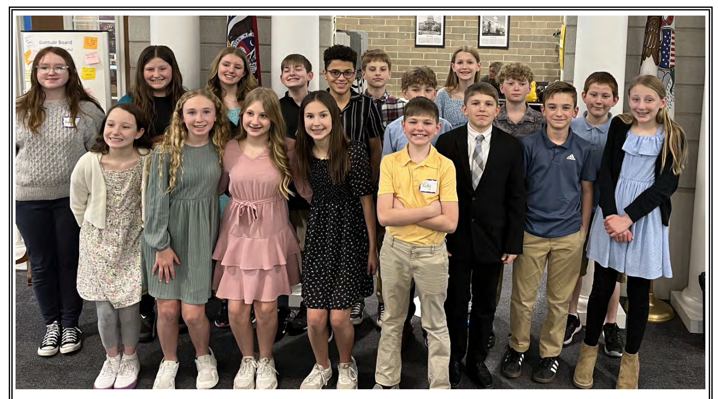
6TH GRADE JUNIOR ACHIEVEMENT BIZTOWN